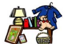
Attic Treasure Sale